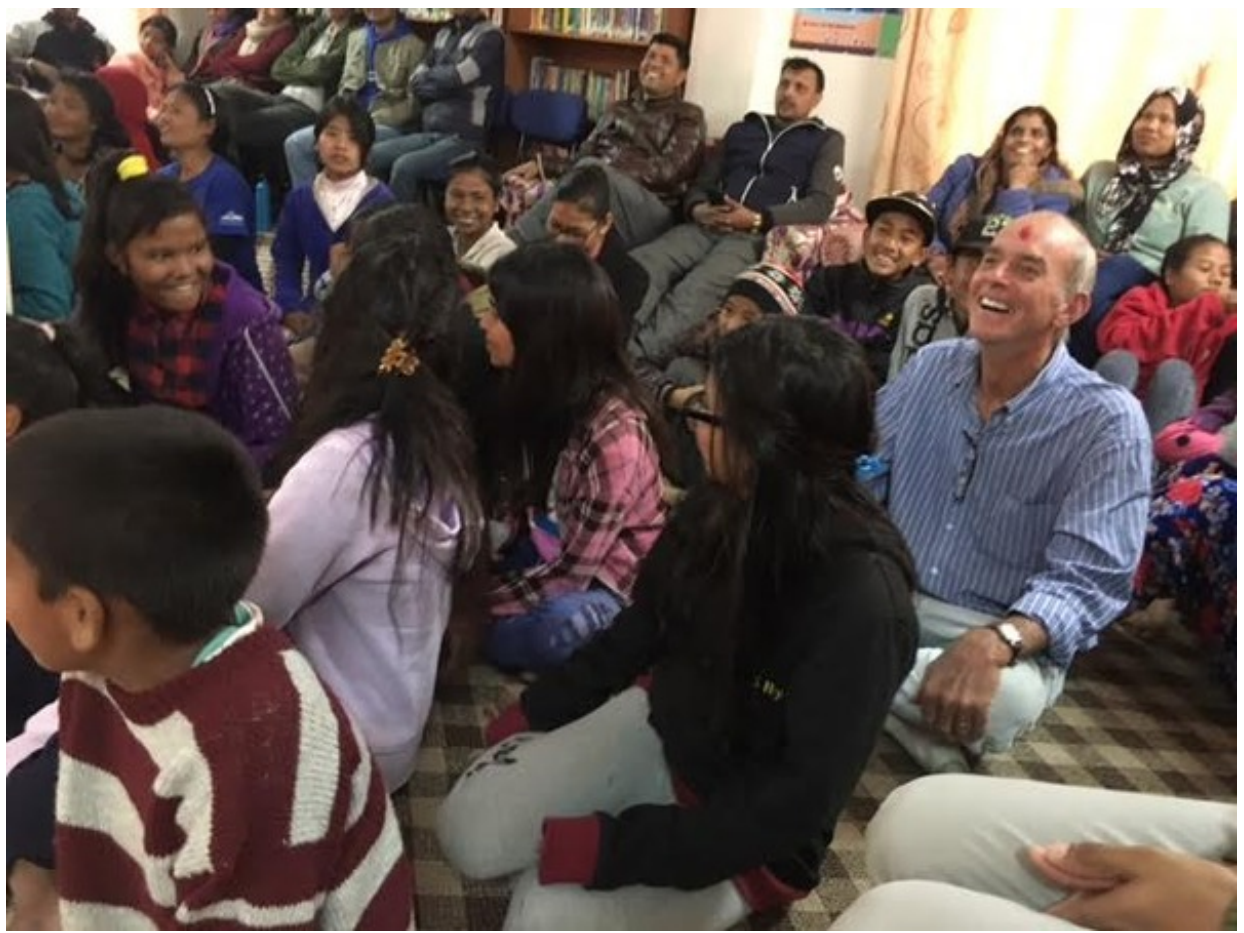
Sports Day! By Sita Timilsina, Class 9