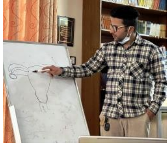
Awareness session for the community women on Basics of Menstrual Hygiene led by local physician

Special events were organized with the women such as International Women's Day Celebration and Diversity Day. The Chelsea Center Women's Council, made up of select leaders among the adult women, served as an advisory group to the Director of Operations and assisted the Chelsea staff in organizing the community celebrations.