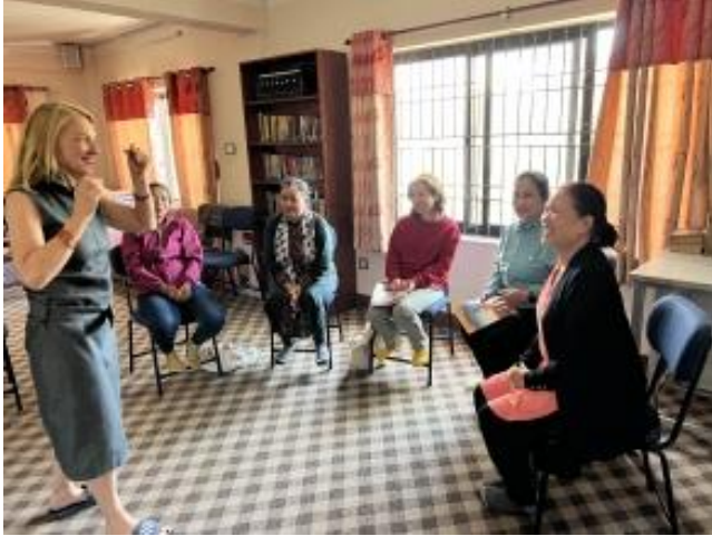
A March conversation class for Advanced English students led by a visitor from Australia