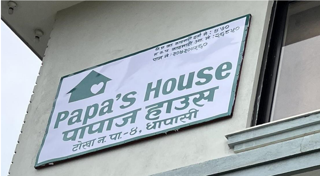
New Papa's House Sign on CECC building

Papa's House has been listed in the "Red Book" published by the municipality, which is the record of the programs and budgets for upcoming years. The municipality has also requested Papa's House NGO to collaborate in after school classes with other government schools of Dhapasi and also for the installation of smart boards at government schools of Tokha municipality.