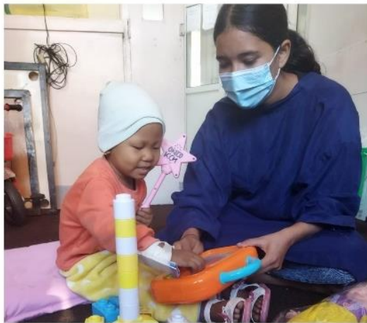
Young patient at Kanti Children's Hospital