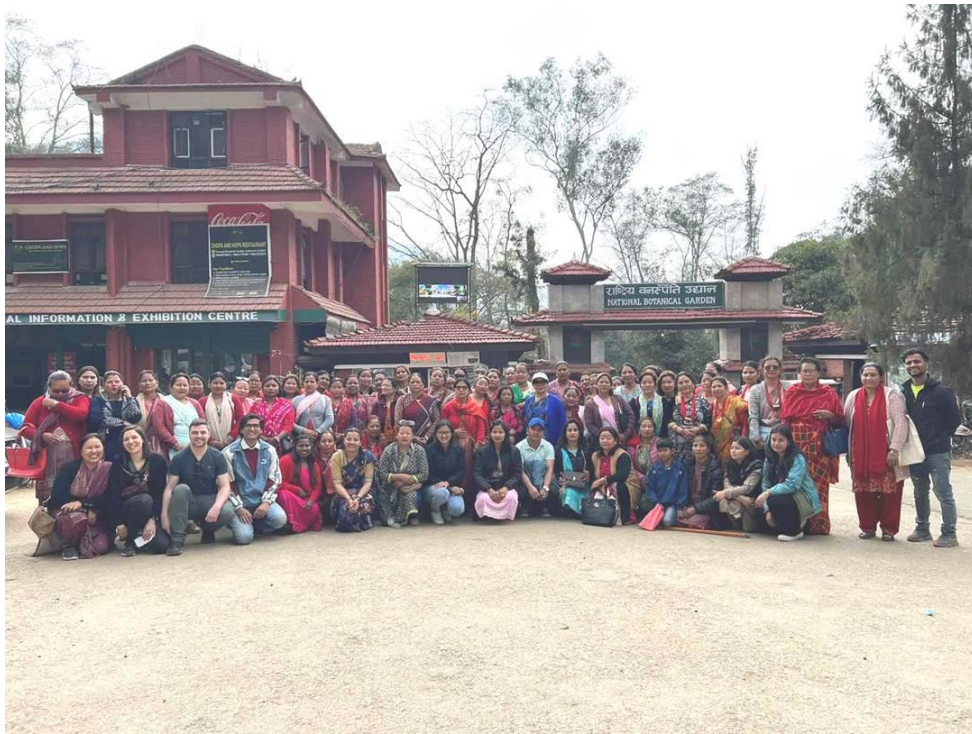
Spring picnic held at the National Botanical Garden for CECC staff and community women students

Special events were organized with the women such as International Women's Day Celebration and Diversity Day. The Chelsea Center Women's Council, made up of select leaders among the adult women, served as an advisory group to the Director of Operations and assisted the Chelsea staff in organizing the community celebrations.