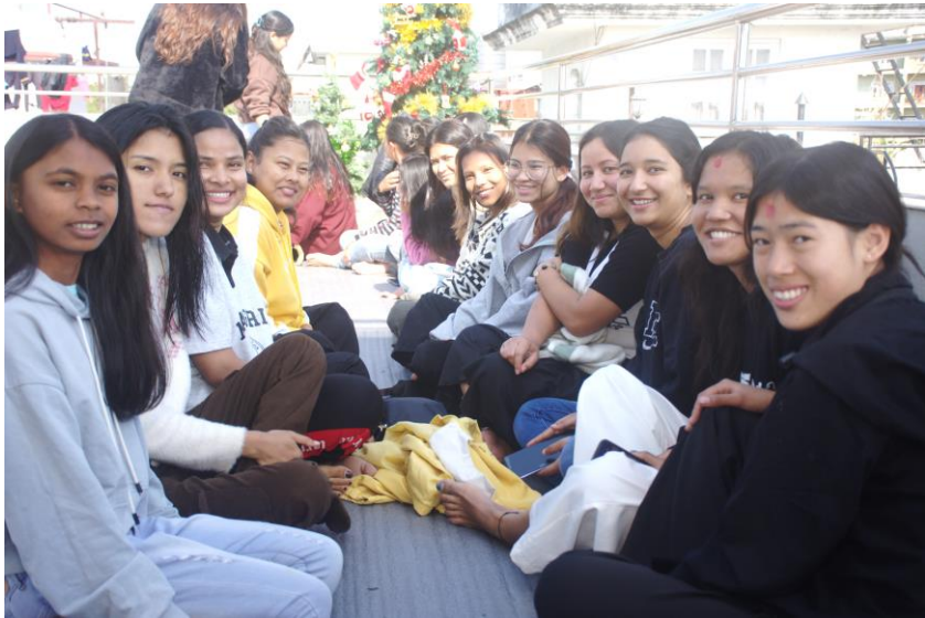
Thanksgiving 2023—Chelsea Center