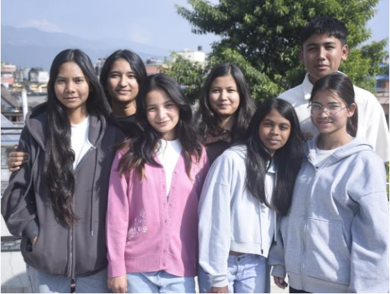
Some of our Papa’s House young adults enjoying the day on top of the Chelsea Center Thanksgiving 2023