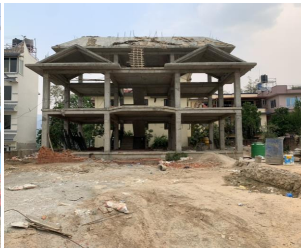
New construction in 2023 in front of Harmony House