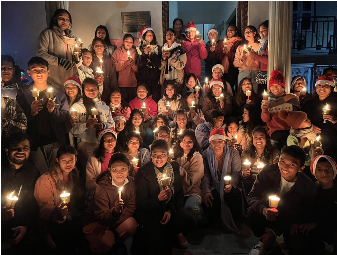
Christmas at Papa's House 2023

name, lip balm, socks, a hand towel and chocolates, along with Rs. 3,000 and Christmas card.