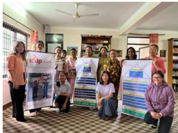
Dhapasi school students studying English at CECC International Child Development Program workshop

For adult literacy and female empowerment, the Chelsea Center continues to offer classes in Nepali, English, and math. In the mornings and early afternoons over one hundred community women regularly attend these literacy classes at the Chelsea Center.