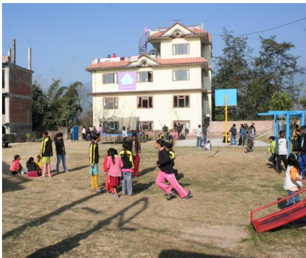
Playground in front of Harmony House in 2014

It was a good run, hallowed grounds upon which our children played, revealed dreams, studied, made best friends forever, put on plays, celebrated brother's and sister's days, where promises were pinky finger committed, and children found character in themselves and others, the place that silently witnessed personal evolution, from being a five-year old bouncing a basketball with both hands to dunking the ball and receiving a full scholarship in college. It is where many in our neighborhood fled during the earthquake, after our wall and gate collapsed; it is also the resting place of a couple of our beloved dogs. It was there that on Christmas Eve candles would be precisely laid out to reveal a message when simultaneously lit from the children's candles after dark, and by whose light Santa arrived on the roof of Papa's House in 2017, to the astonished and misty-eyed children looking skyward after hearing him bellow out Merry Christmas! It was our "Field of Dreams" where every Saturday the children from the five homes of NOH would congregate for lunch and play. It is where we grew as individuals and as a family, and it is now unrecognizable but for in our hearts.