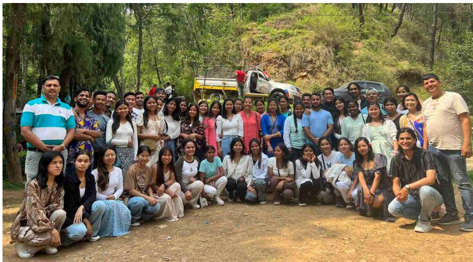
Summer picnic for Papa's House young adults and staff

In early summer many of our older children, those still in college or having graduated, organized a picnic. It has always been a pleasant daydream to think of the day when all our children reunite. They do a good job of staying connected with social media, and those remaining in our area of Kathmandu see one another frequently. But now with some of our children in Japan, Germany, Croatia, Tanzania, Malta, Australia, Portugal, Finland, and the US, our Papa's House diaspora grows.